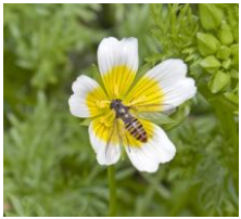
Poached Egg Plant